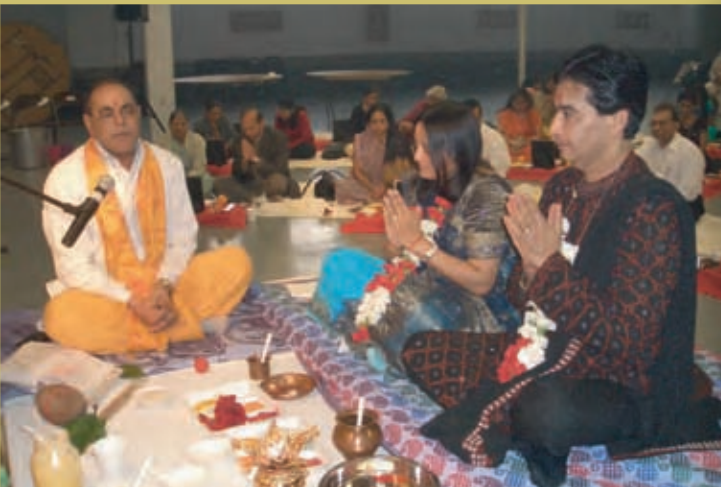
Satya Narayan Katha, January 2005