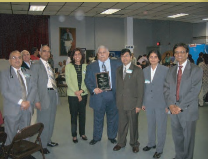
Health Fair, September 2005