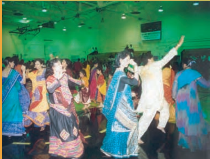
Navratri Dandiya Raas