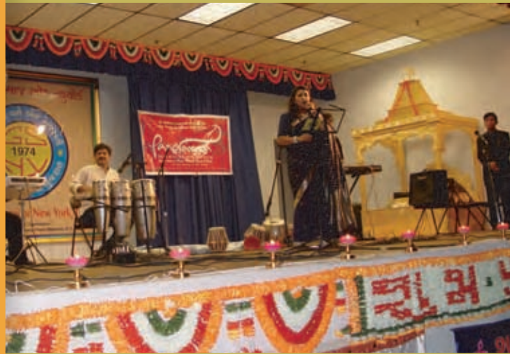
Diwali Musical Evening Kausumbino Rang November 2005