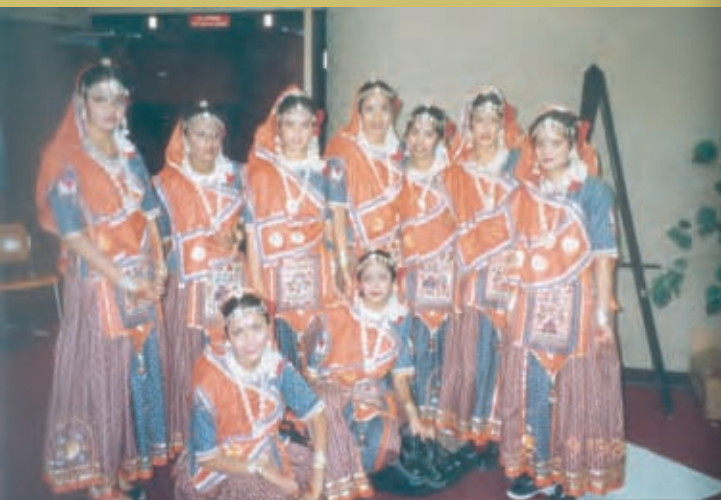
FOGANA Winners, September 2005